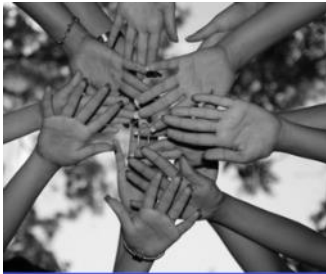
ALL HANDS ON DECK

The Property Board has a list of large and small projects to be done inside and outside the building, and they need your help. If you can use a paintbrush, rake, or screwdriver, you're hired! If you are not scared to climb a ladder, you're hired! If you have a familiarity with